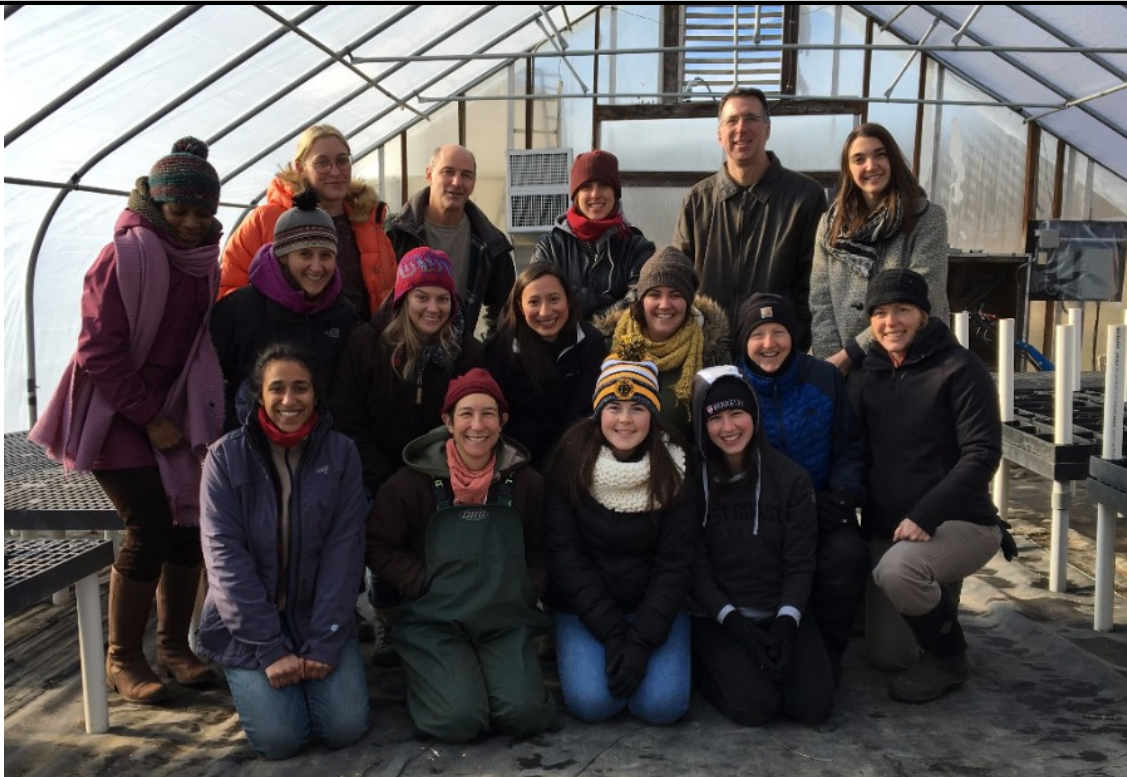
December 19, 2017, New Entry Staff, Farmers, and Volunteers after successfully 're-plastic'ing the greenhouse at Ogonowski Incubator Farm in Dracut, MA.