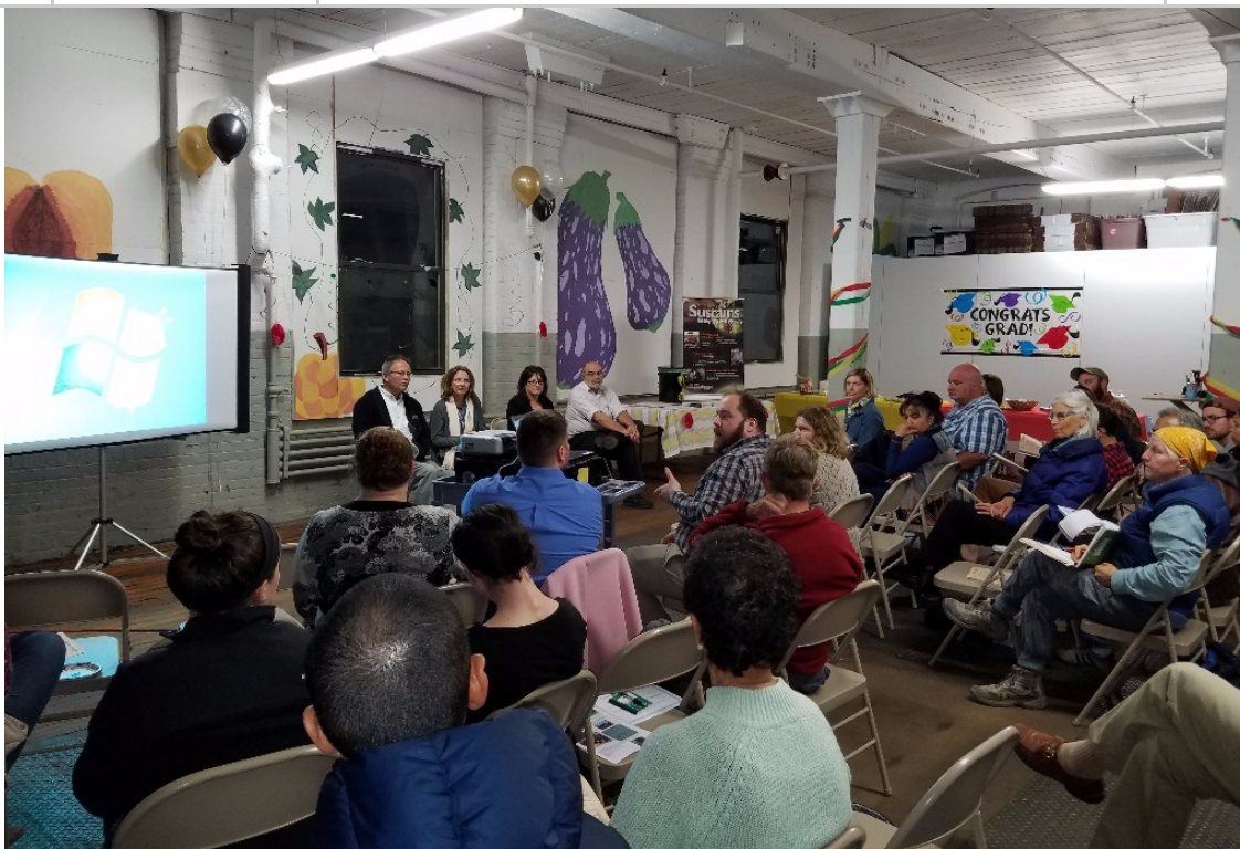
Risk Management Panel at the Farmer Graduation