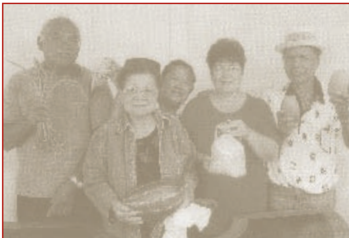
Seniors receive Kauai Fresh foods