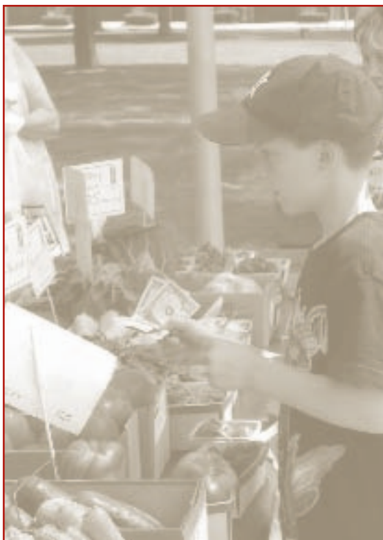
Youth purchases food at a farm-stand sponsored by the Greater Pittsburgh Community Food Bank