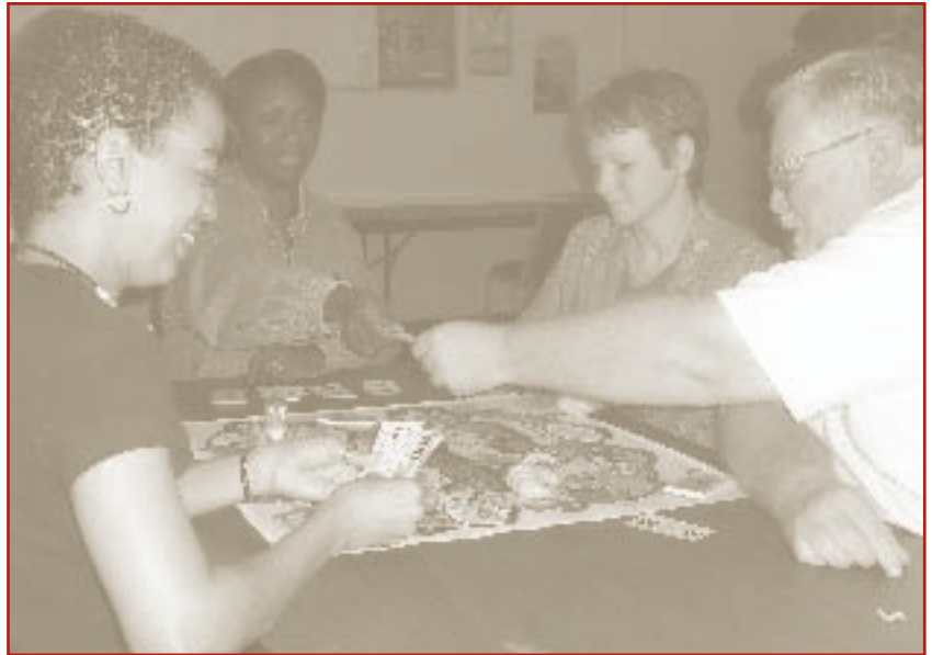
Hunger 101 participants play Feast or Famine Board game

Such a dramatic shift needs resources, information, and leadership. A partnership between the food banking community, the community food security movement, funders, and legislators will be necessary. The following are recommendations to make this expansion a reality: