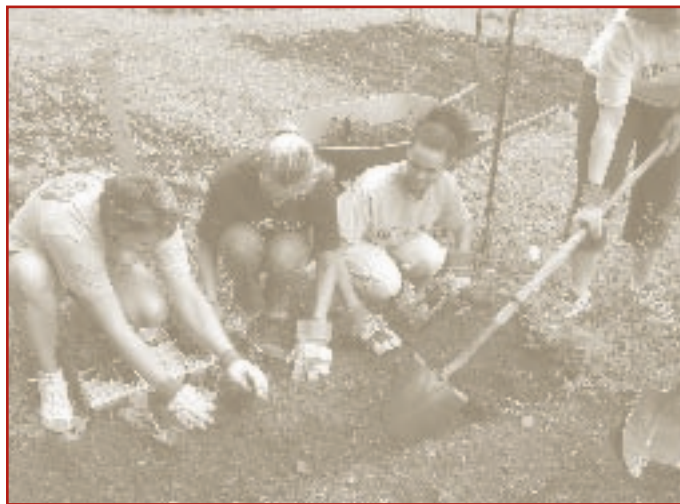
Atlanta Community Food Bank volunteers working in a community garden