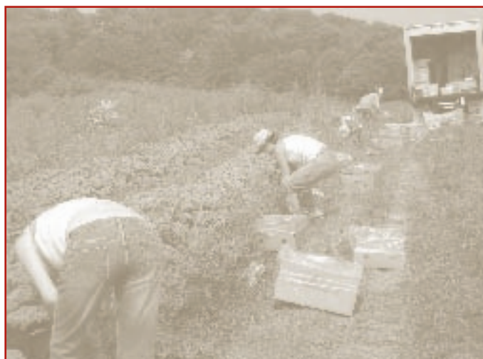
Harvesting kale at a local farm for the Pittsburgh Food Bank