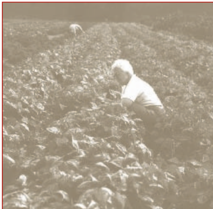
Harvest Time at the Western Massachusetts Food Bank Farm

The farm is an example of a program that is economically self-sufficient which adds one slice to the community food security in the region. The farm also engages shareholders into The Food Bank as a whole, creating a natural constituency. For example, when The Food Bank put out an emergency alert for the need for food drives this fall, farm shareholders brought in over 2,000 pounds of peanut butter, soup and other non-perishable meals. While shareholders often see their farm share check as their monetary donation to The Food Bank and do not necessarily contribute more, the farm does create awareness of hunger and of the role and mission of the entire organization.